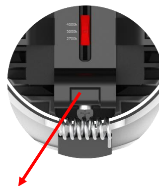
Bult-in Triac Dim. Driver